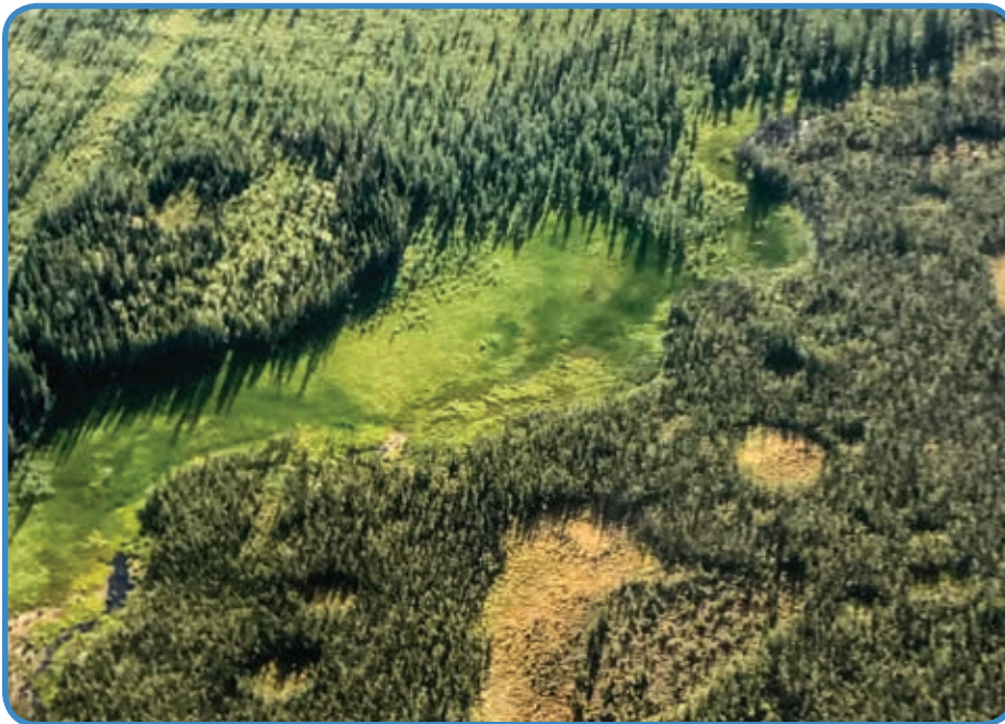
Aerial view of land cover types near Scotty Creek Research Station, NWT.